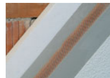
Brick construction with Styrofoam insulation - Initial temperature: 19°C