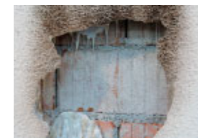
After 35 seconds Styrofoam insulation disintegrates - Surface temperature: Less than 1000°C