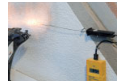
After 20 minutes surface temperature: 856°C