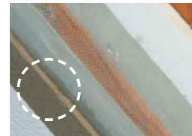
Brick construction with Styrofoam insulation covered with THERMOSILIT® plaster - Initial temperature: 19°C

**Brick construction - Cement adhesive - Styrofoam insulation - Fiberglass mesh/screen - Rough hydrophobic base plaster - Fine white finishing plaster