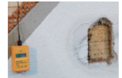
After 15 minutes surface temp.:1080°C, Wood surface temperature: 44°C, No damage to wood construction