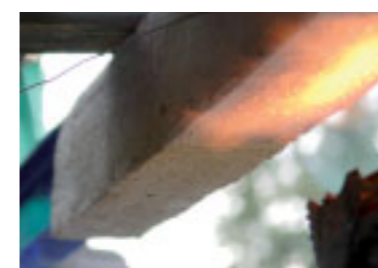
Steel beam covered with THERMOSILIT® plaster - Initial temperature: 19°C