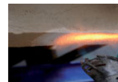
After 30 minutes surface temperature: Over 1000°C - No damage to steel beam