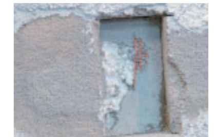
After 30 minutes surface temperature: 1080°C - no damage to Styrofoam insulation