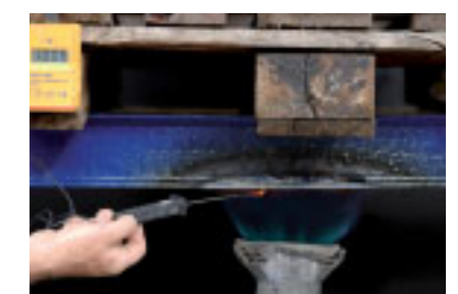
Steel beam without THERMOSILIT® After 7 minutes surface temperature: Over 1000°C - Steel beam begins to bend