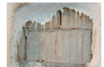
Appearance of damaged Styrofoam insulation after cooling