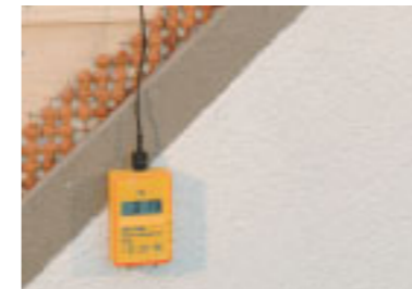
Wood construction covered with wire mesh THERMOSILIT plaster - Initial temperature: 19°C

*Wood construction - Wire mesh/screen nailed to wood surface - Rough hydrophobic base plaster - Fine white finishing plaster