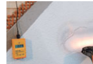
After 8 minutes surface temperature: 1080°C Wood surface temperature: 29°C